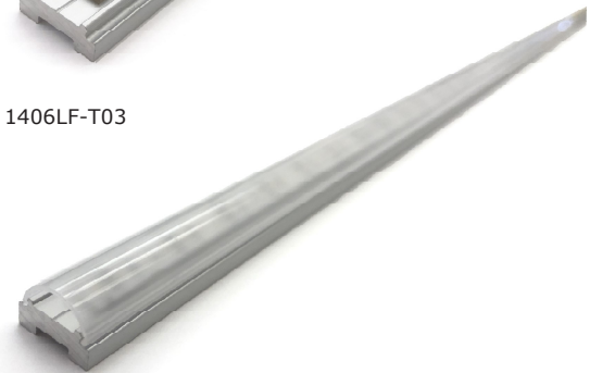
1406LF-T03-L (Semi Translucent Lens Cover)