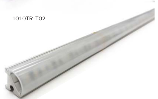
1010TR-T02-L (Semi Translucent Lens Cover)