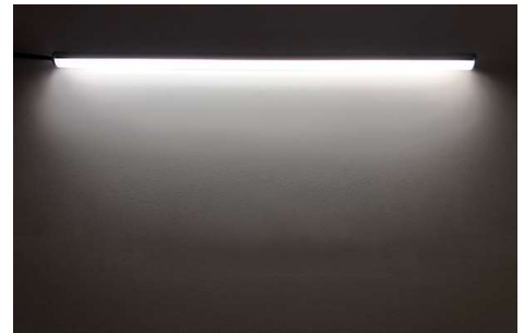
Lighting effect reference