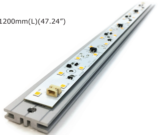
Diagram: Available upon request