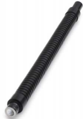
Goose Neck Jacket