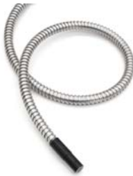
Flexible and Durable