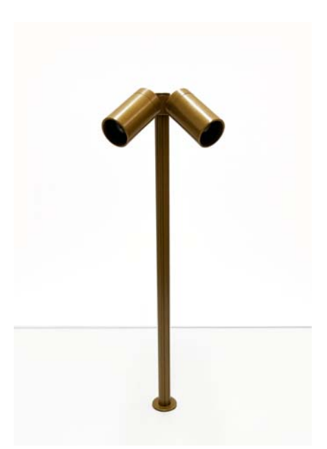
VMS Double Head Spots