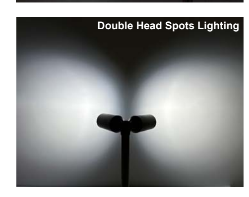
2 Spots Lighting